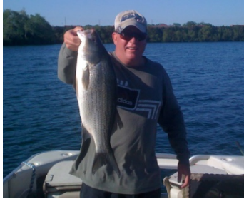
Lake Monroe Trophy Hybrid Striped Bass (Wipers)