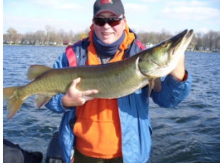
Lake Webster Ranked in the Top 5 Muskie Lakes in the World