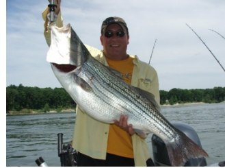
Raccoon Lake Trophy Striped Bass (Stripers)