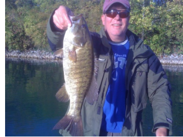
Trophy Great Lakes and River Smallmouth