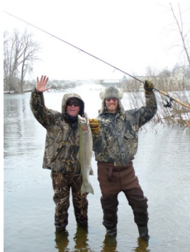
Trophy Northern Indiana Steelhead